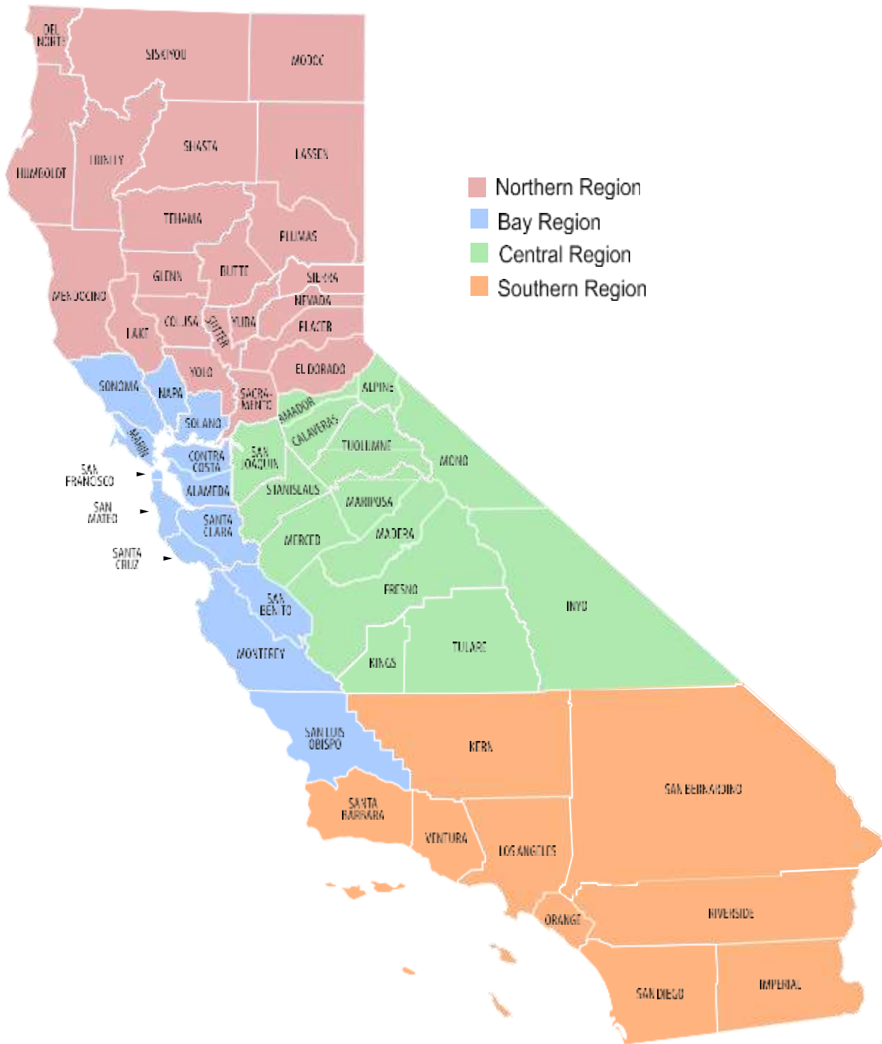
EXHIBIT 1 – REGIONAL MAP